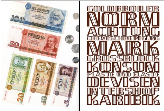
Sektor typeface by Sylvia Janssen - derived from East German banknotes