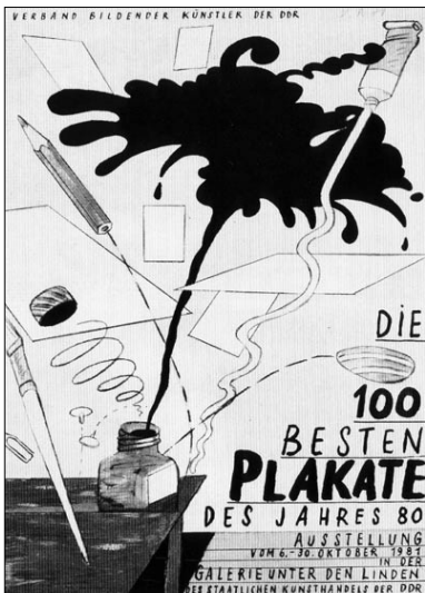
Volker Pfüller (1981)

Volker Pfüller and Helmut Brade have very expressive and calligraphic approaches to typography in their theatre and exhibition posters. Hand drawn typography and image become linked into a coherent artistic statement. Idiosyncrasy and the unique character of personal handwriting stand in opposition to the homogenous collective. Brade found that alternatives to letterpress type, like Letraset, were simply too expensive.