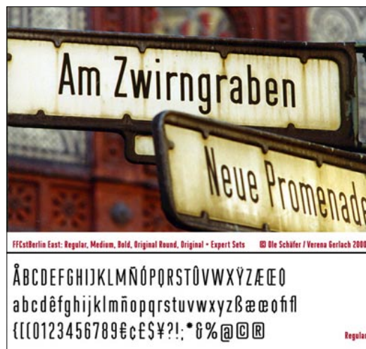
FF City Street Type (2000) Ole Schäfer & Verena Gerlach

Other designs have come from more unusual sources. The humble East German banknote inspired Sylvia Janssen to design Sektor as part of a series of banknote-style fonts relating to themes of consumption. FF City Street Type (2000) by Ole Schäfer and Verena Gerlach is a family of fonts based upon the distinctive (and now almost forgotten) street signage systems of West and East Berlin. Schäfer and Gerlach had a huge respect for the typographic standards of the Eastern designers and were inspired by signs bought in a fleamarket.